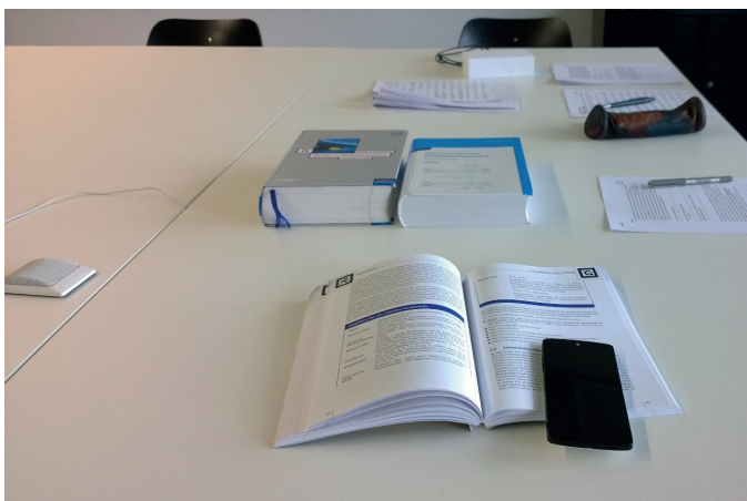
Setting of usability test

Different technical approaches to scan and track the book's page were conceived and afterwards revised with the use of usability tests.