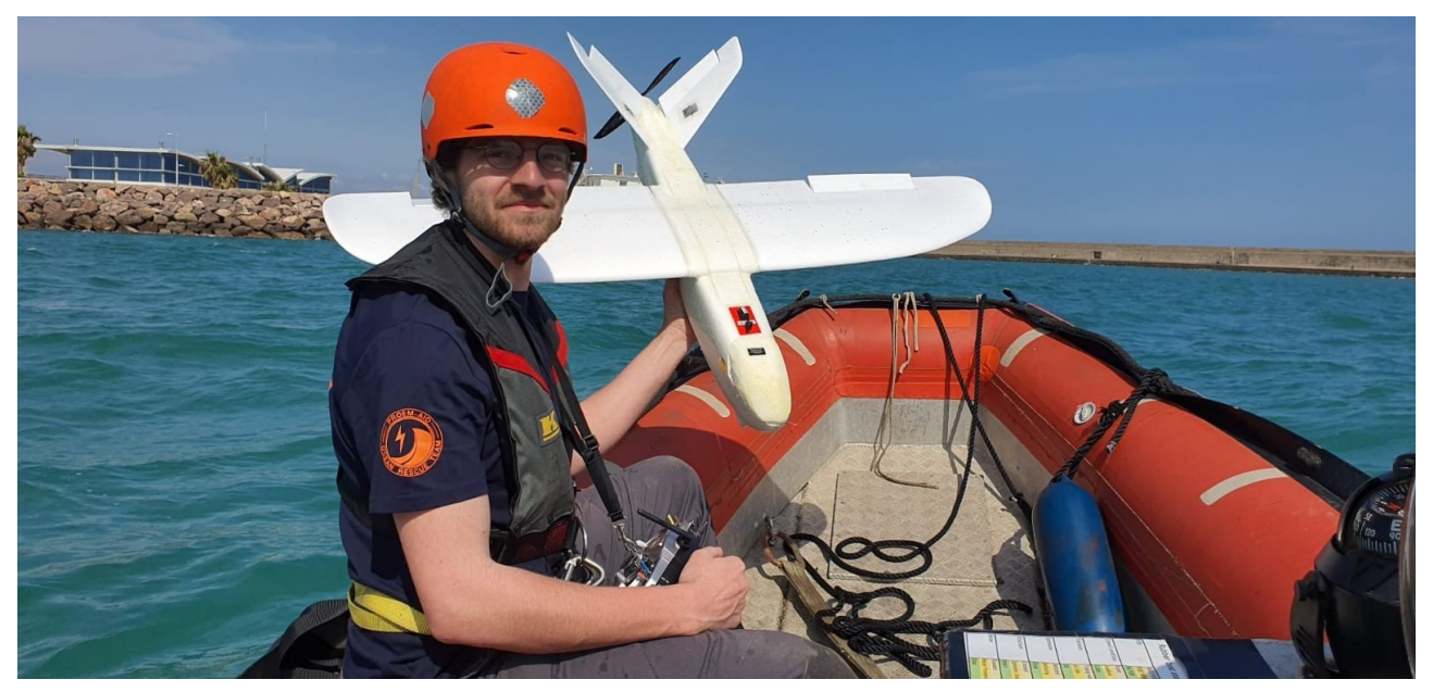
Fig. 1: SearchWing Drone

The SearchWing Drone is an autonomous unmanned aerial vehicle that searches for boats on the ocean. The drone is designed to be operated by the regular crews on the rescue vessels. It takes GPS tagged photos ready for download and analysis after landing.