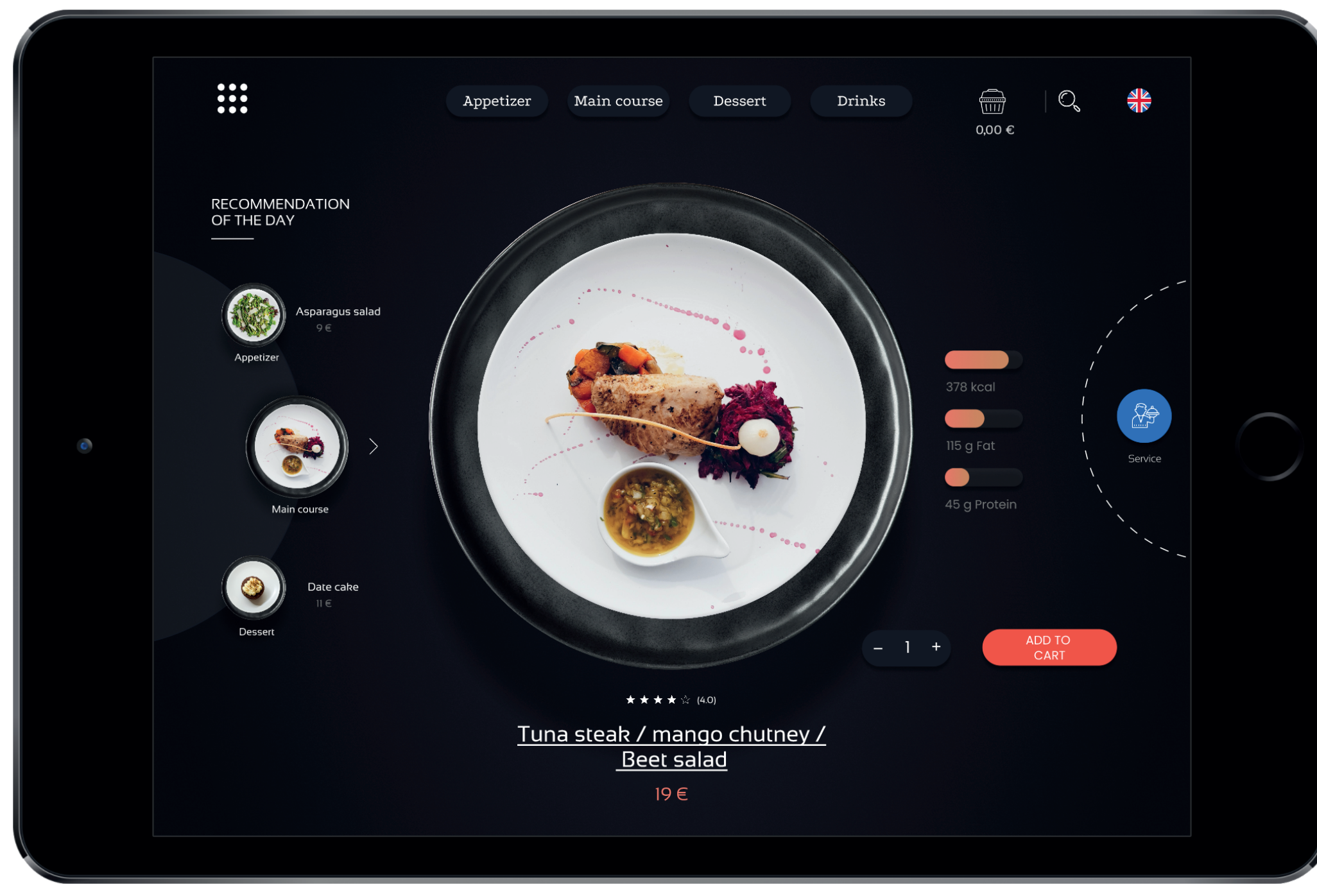
Home screen multilingual

The development of a high-fidelity prototype will be used to evaluate the user experience through user tests. In addition, the finally developed prototype should be able to provide a basis for further concepts in relation to this master thesis.