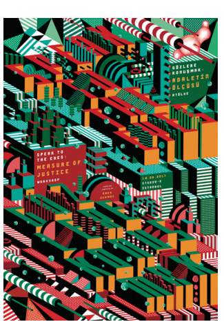
Sarp Sözdinler: Measure of Justice, Workshop

"When I use a word, it means just what I choose it to mean—neither more, norless." Alice, in: Through the looking Glass