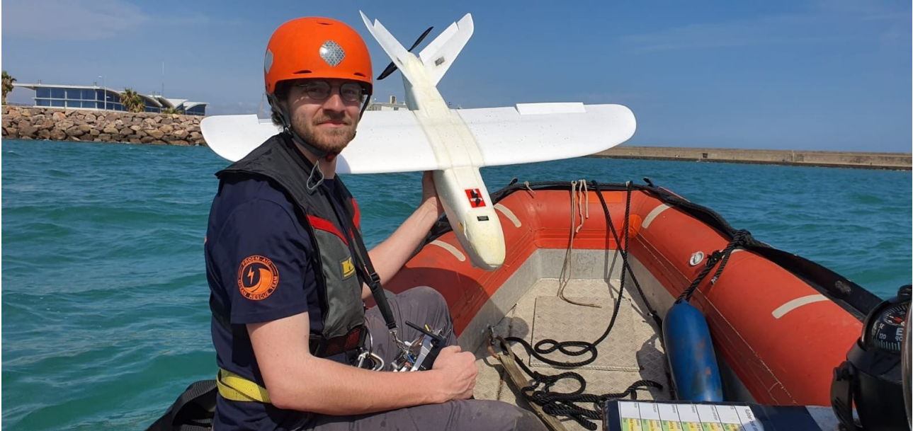
Fig. 1: SearchWing Drone

The SearchWing Drone is an autonomous unmanned aerial vehicle that searches for boats on the ocean. The drone is designed to be operated by the regular crews on the rescue vessels. It takes GPS tagged photos ready for download and analysis after landing.