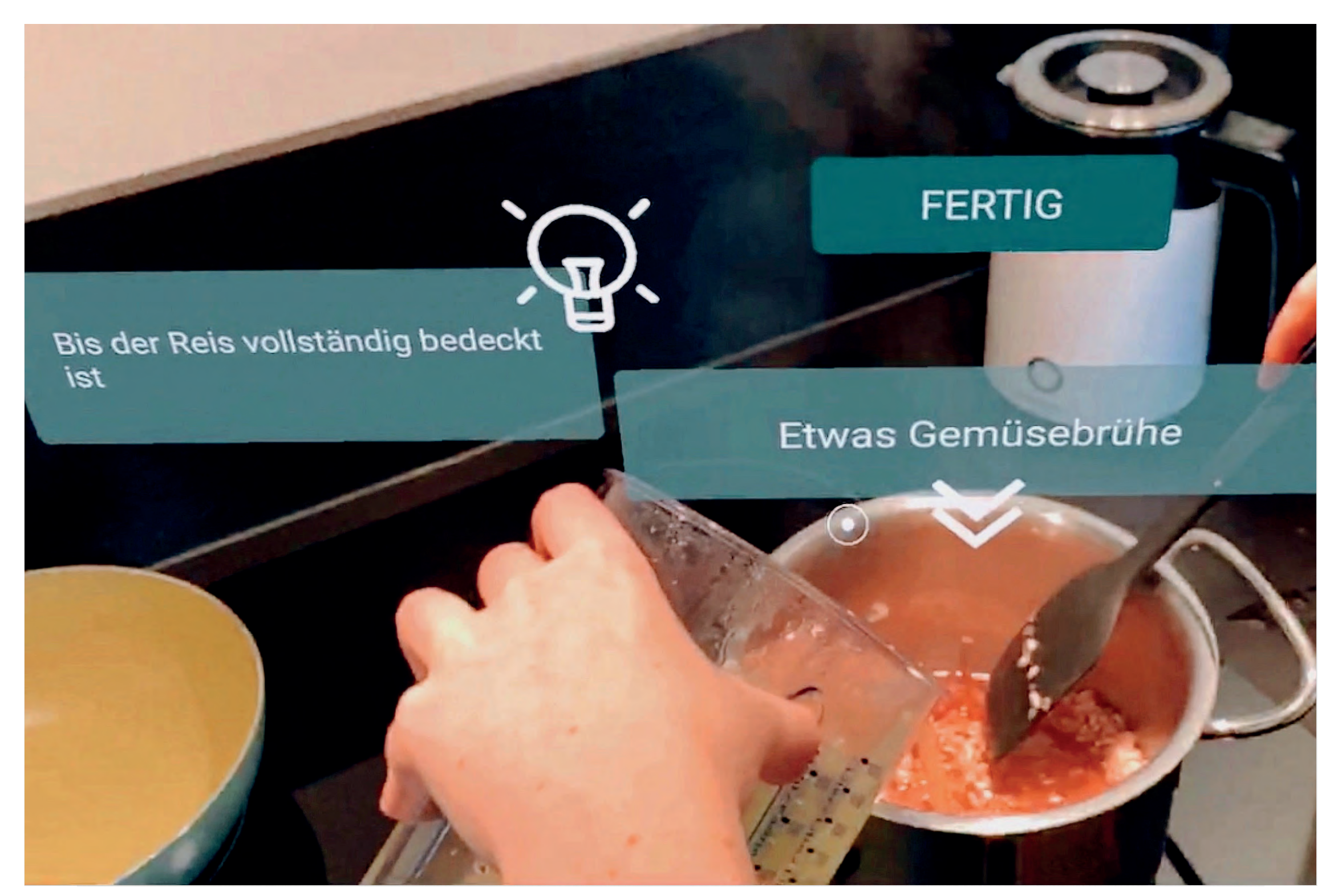
Virtual instructions during the cooking process